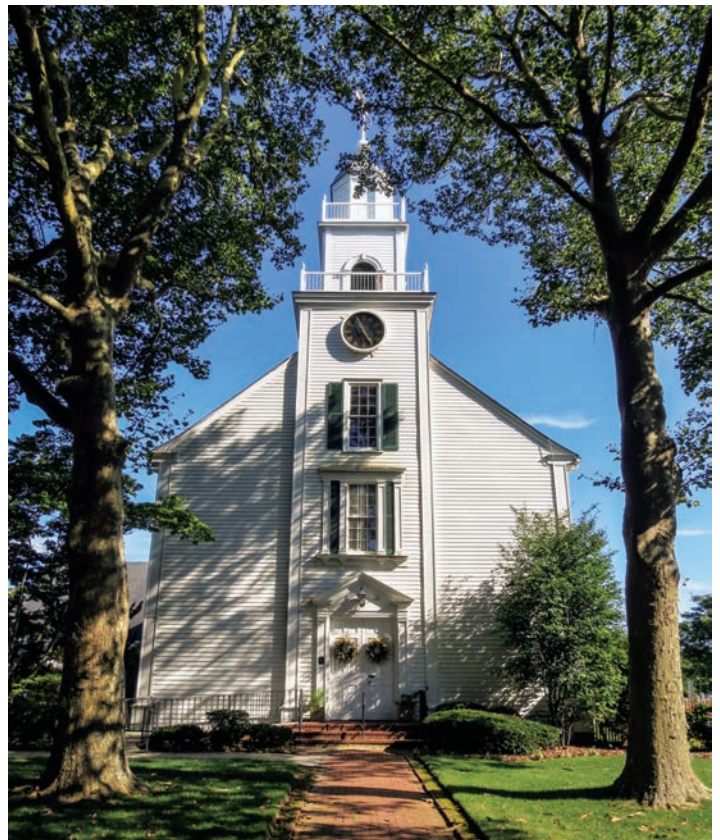
First Presbyterian Church, Southold (Suffolk County)