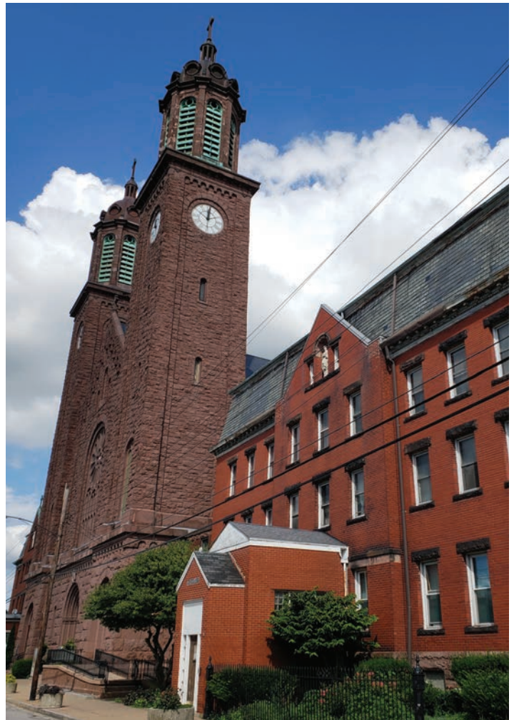
Corpus Christi Church, Buffalo (Erie County)

Stuyvesant Heights Christian Church, Bedford-Stuyvesant $3,500 - Roof and Window Assessment and Project Management