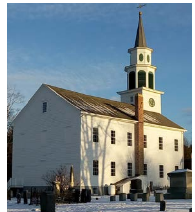
St. Peter's Presbyterian Church, Spencertown