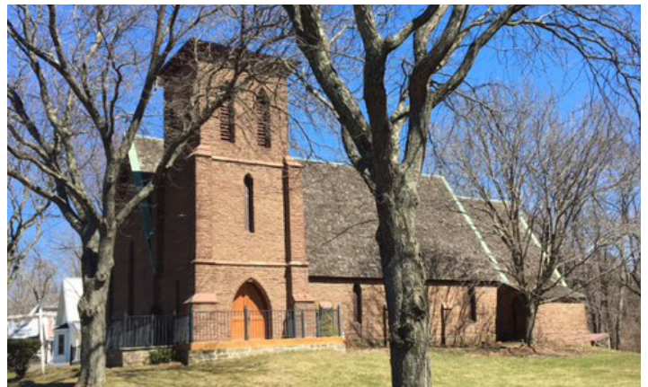
Christ Episcopal Church, Greenville