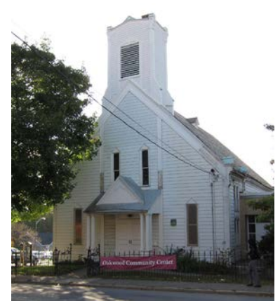
Oakwood Community Center, Troy

Sacred Sites and Consulting Grants pledged a total of $192,100 in the form of 32 grants to 31 religious institutions, leveraging over $1 million in repair and restoration projects.