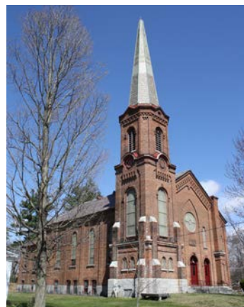
Bottskill Baptist Church, Greenwich