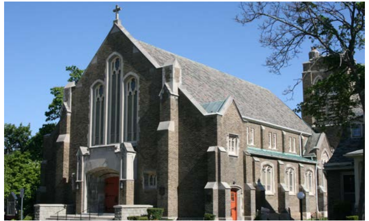
Our Savior Lutheran Church, Buffalo

Broadway Presbyterian Church, Morningside Heights $7,500 - Architectural Fees for Exterior Envelope Restoration