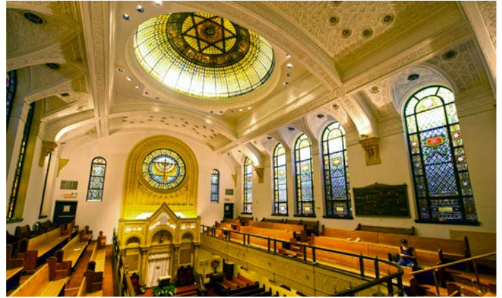
Congregation Ohab Zedek, Upper West Side

First Baptist Church of DeWitt Park, Ithaca $5,000 - Restoration of Stained Glass Window