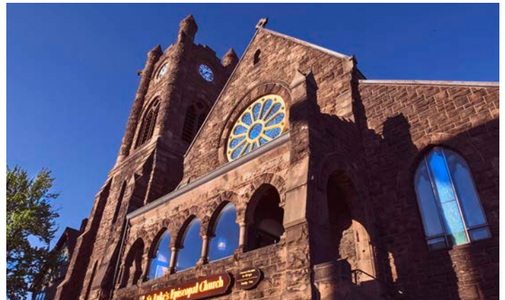
St. Luke's Episcopal Church, Jamestown

Bottskill Baptist Church, Greenwich $40,000 - Roof Truss Stabilization and Repair