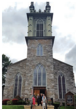
St. John's Episcopal Church, Johnstown