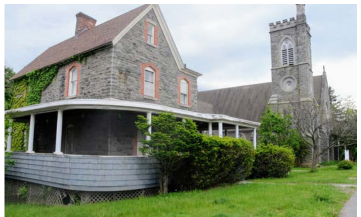
St. John's Episcopal Church, Monticello

Sacred Sites and Consulting Grants pledged a total of $192,100 in the form of 32 grants to 31 religious institutions, leveraging over $1 million in repair and restoration projects.