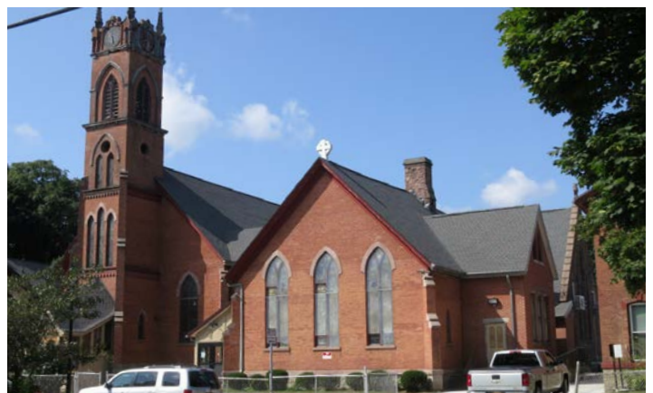
Jefferson Avenue Seventh-day Adventist Church, Rochester