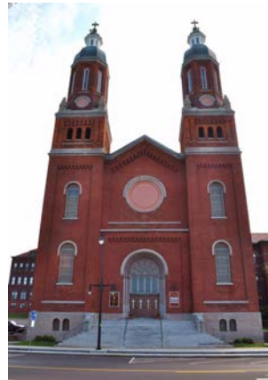
St. George's Episcopal Church, Newburgh