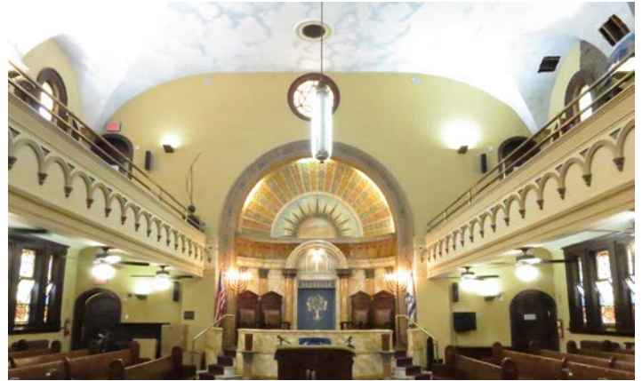
Park Slope Jewish Center