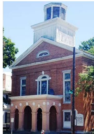
Joy of Troy Seventh-day Adventist Church