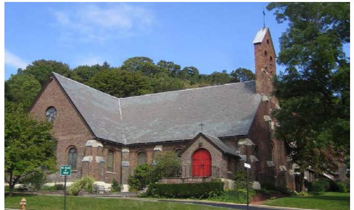
Trinity Episcopal Church, Roslyn